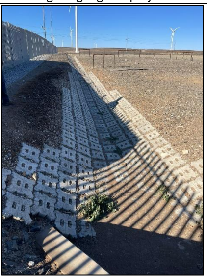
12. Stormwater drain