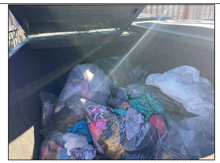
11. Oily rags and hazardous waste stored in skips with lids until removal from site