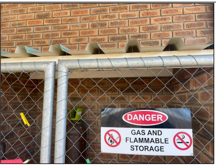
10. Danger signage displayed as needed