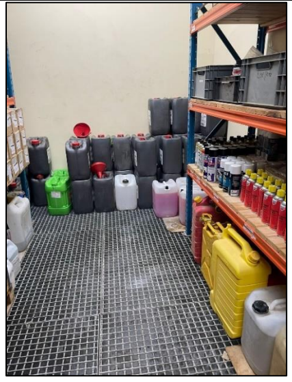
5. Built-in bund within the chemical store