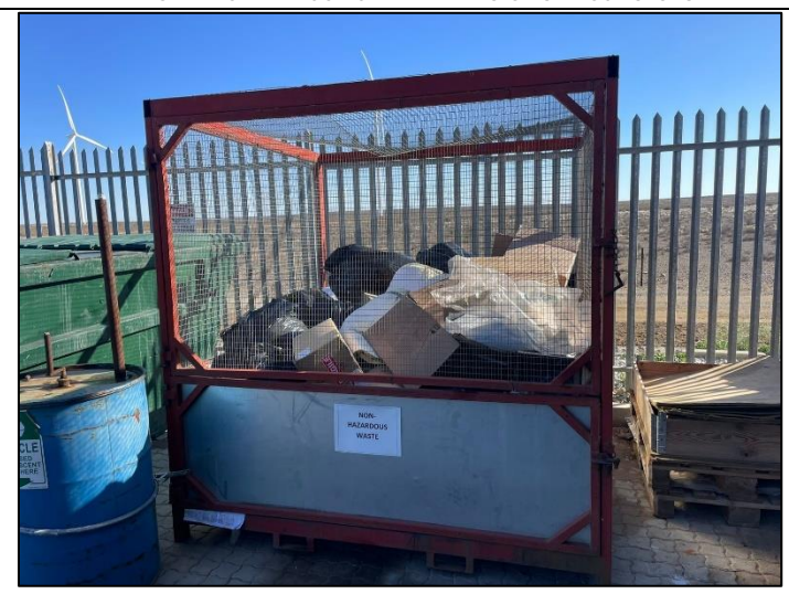
7. General waste storage cage