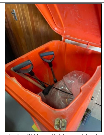
3. Stocked spill kit available outside chemical store