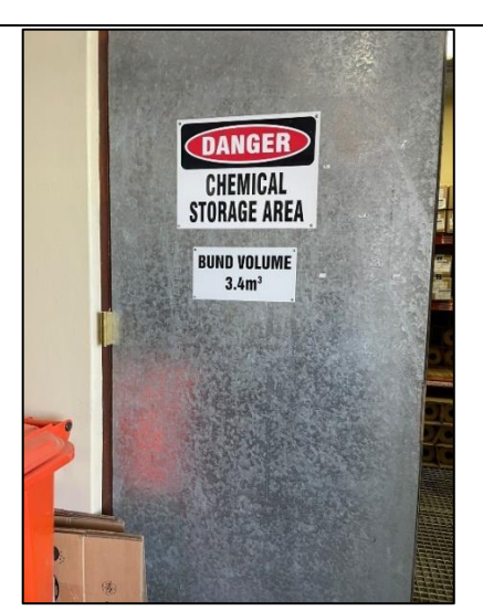
4. Purpose built bunded chemical store