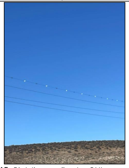
15. Bird diverters fitted to OHL as required