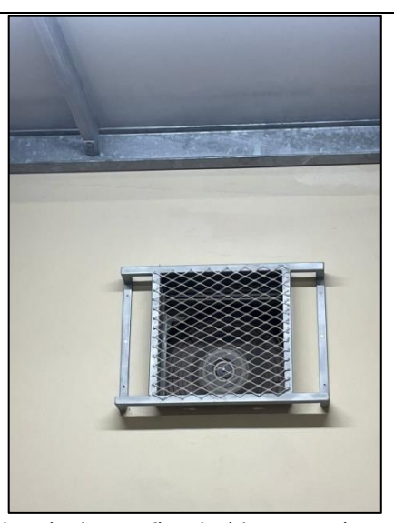
6. Chemical store fitted with appropriate extraction