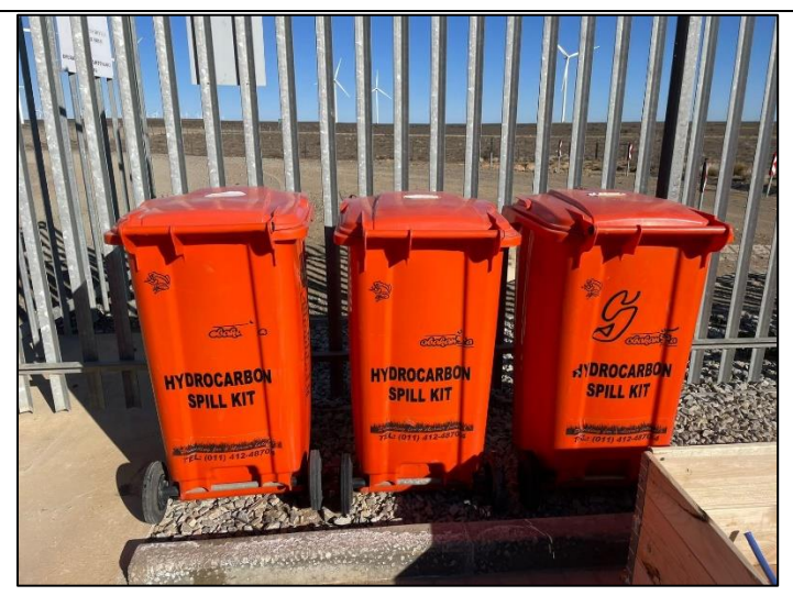
9. Hydrocarbon spill kits