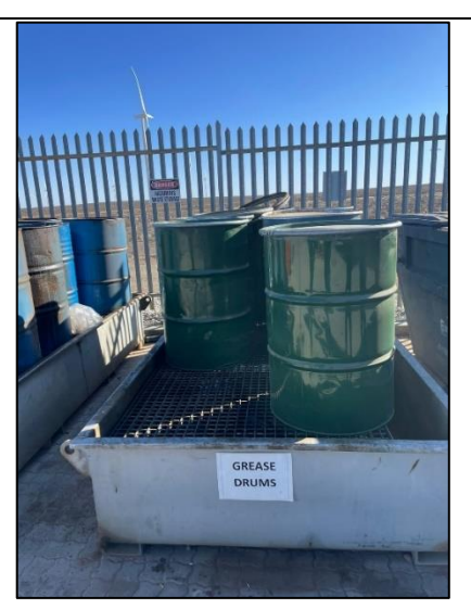
14. Grease drums stored in secondary containment