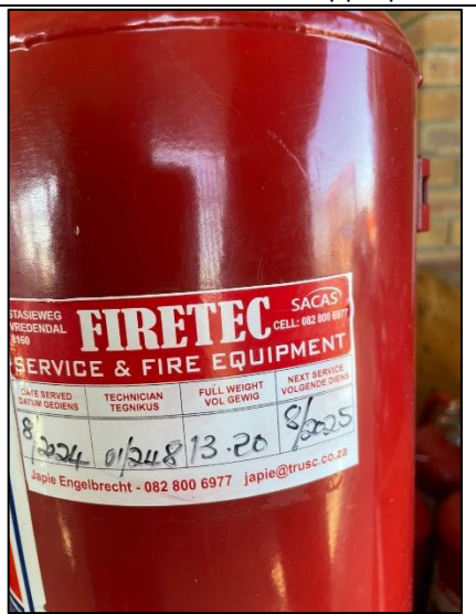
8. Fire extinguishers recently serviced and available where needed