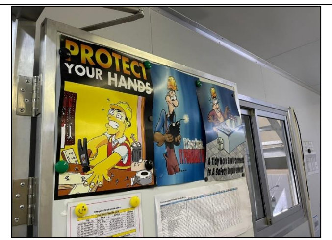
1. Posters sharing HSE requirements

The photographs below are indicative of the site conditions on the day of the audit.